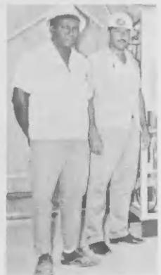
Plant Analyzers (I Rasmijn and